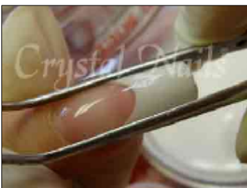
7. Use the C curve Bending Tweezers to create The perfect C curve.