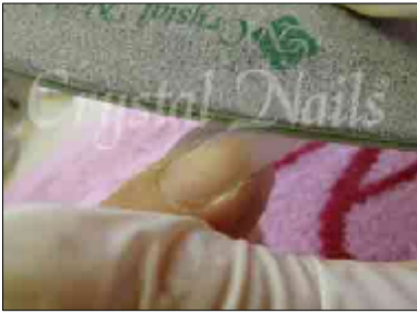
3. File the on the Tip with CN or Xtreme file 150/150.