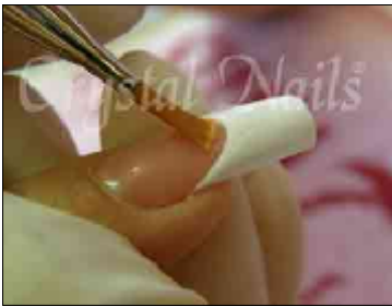
5. Create the free edge and the smile line with CN Builder Xtreme White gel.