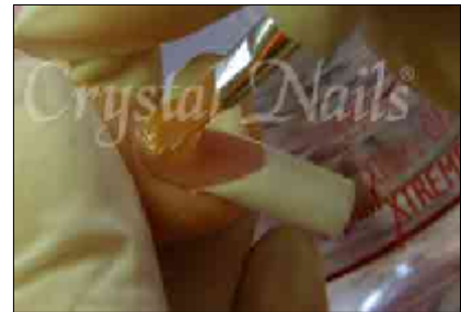
6. Cover with Xtreme Clear gel.