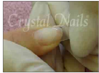
2. Apply the Crystal Clear Competition Tip.