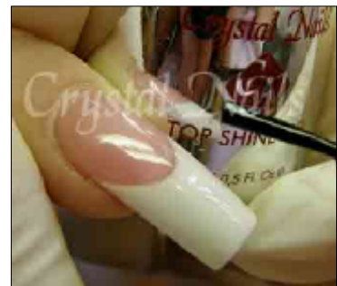
8. Finish with CN Top shine gel.