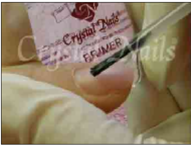
1. Prepare the nails. Use Nail prep and Primer.